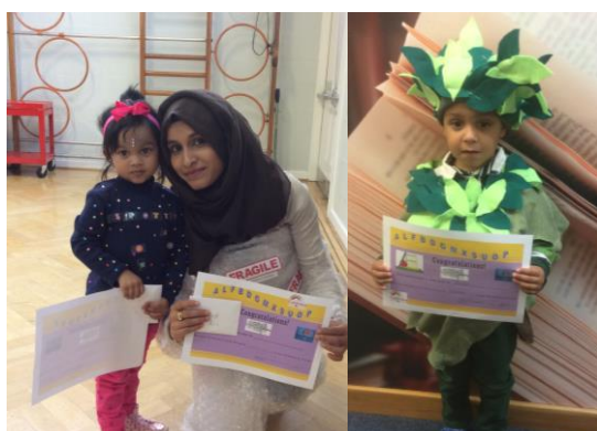
SPOTTY & FRAGILE